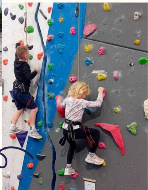
Brave young carers tackle the climbing wall!