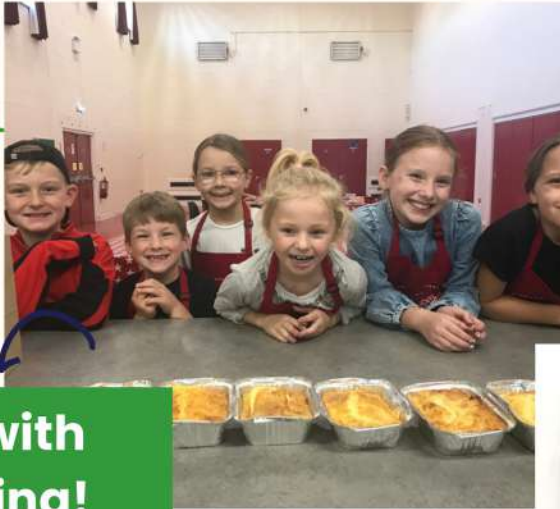
Fun with cooking!