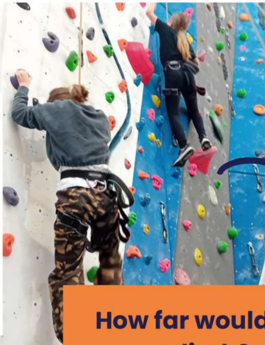
How far would you climb?